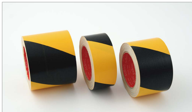
Floor tapes for marking zones. Warning or anti-skid tapes.