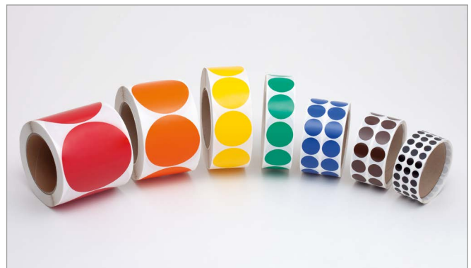
Marking dots for visual marking.