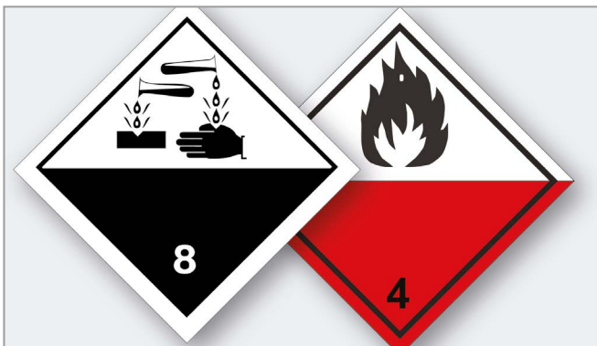
Dangerous goods, warning labels.