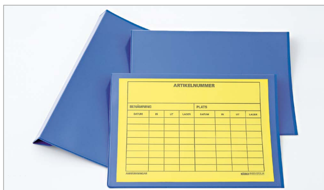
Information card pockets for pallets and shelves.