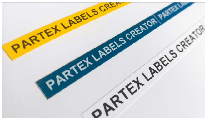
Continuous vinyl labels printable in TT label printers for outdoor use.