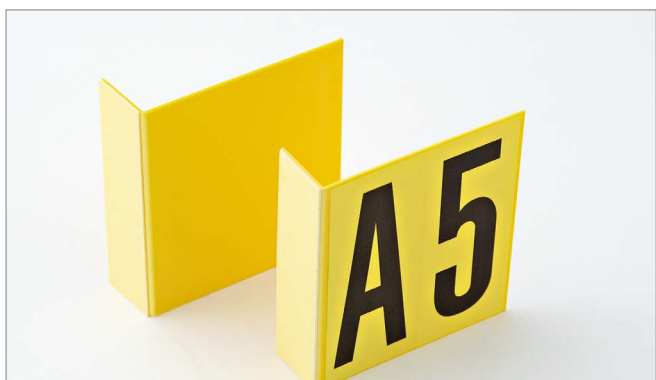
Blank plates for marking with standard number/letter cards.