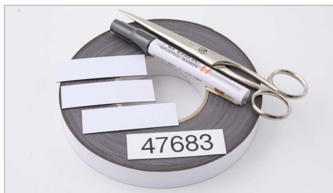
Magnetic tape, printable and writable.