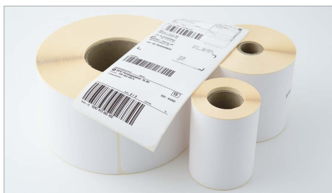
STE shipping labels. Optionally on rolls, A4 sheets or as folded web.