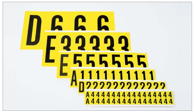
Preprinted self-adhesive letters and numbers.