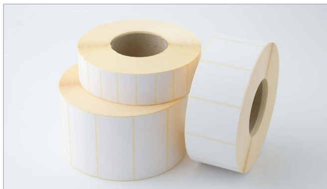
Thermal-transfer and direct thermal paper labels.