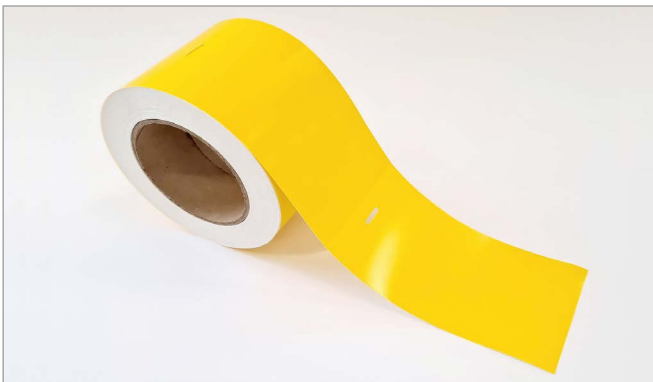
Perforated PE tags printable in label printers. Fastened with cable tie or tacker.