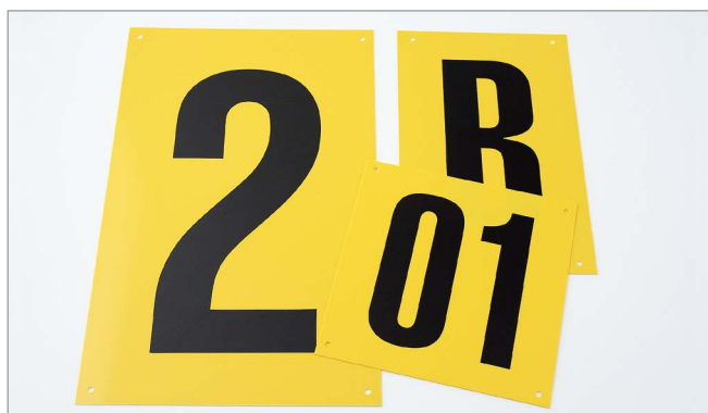
Preprinted signs for marking rows, sections and aisles.