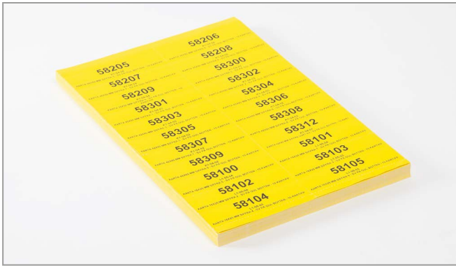
Self-adhesive polyester A4-sheet labels printable in monochrome laser printers.