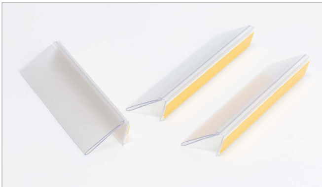
Label holders for racks or shelves, with self-adhesive or magnetic tape.